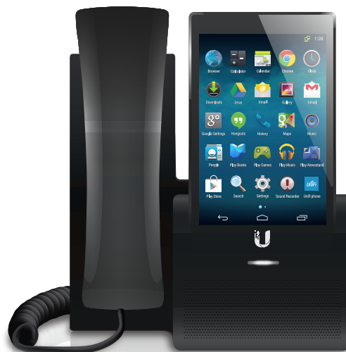
Multi-Touch Color Display

5" or 7" High-Definition, Multi-Touch Color Display Navigate the UniFi VoIP Phone using the touchscreen display.