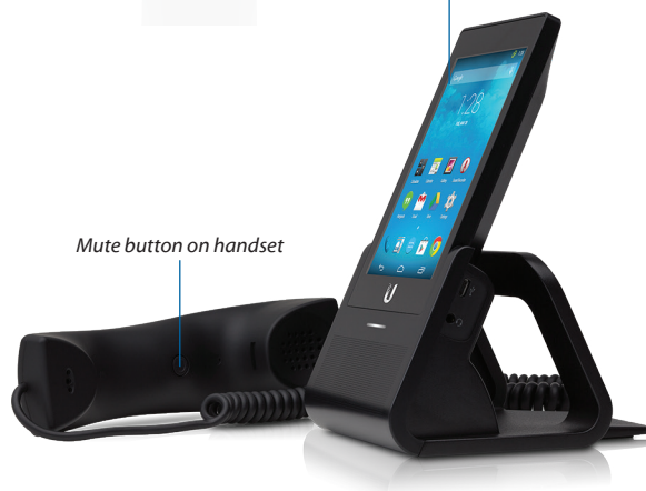
Mute button on handset